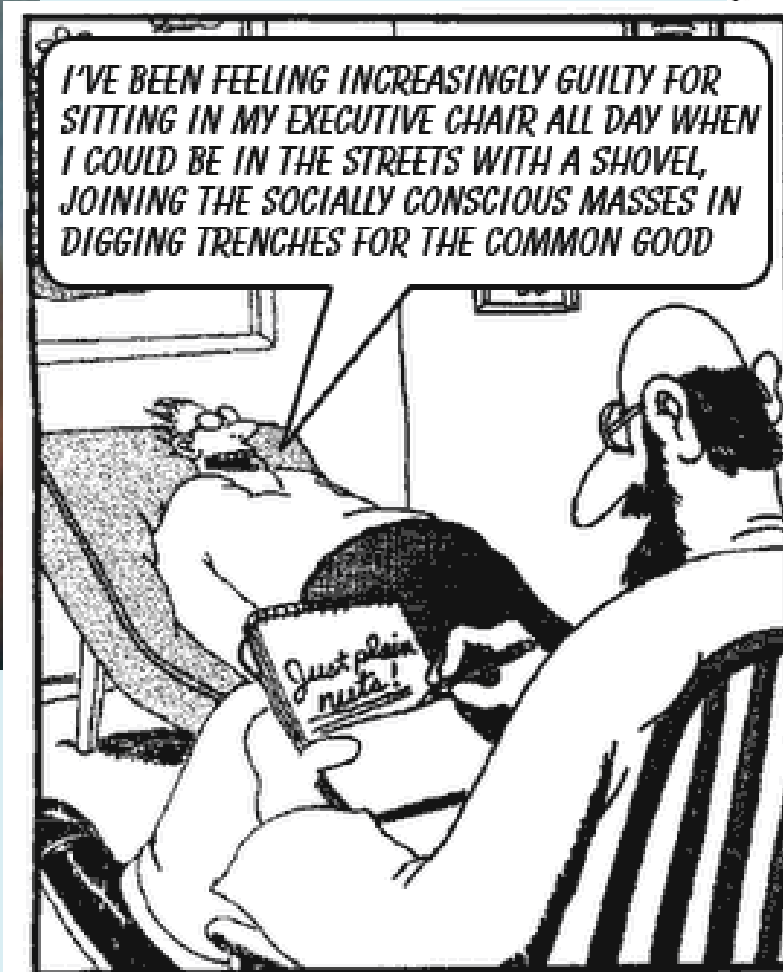
THE FAR LEFT SIDE BY GARIK LARSOV & THEPEOPLES.CUBE.COM